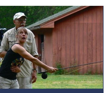
Fly Fishing Instruction

The Chapter holds many educational general meeting programs on fishing and conservation topics that are free to the public. The Chapter holds several Introduction to Fly