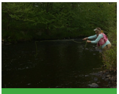
A Pocono Stream

The Brodhead Chapter works with local government a n d conservancies advocate and provide some financial for assistance protection of coldwater resources headwater including at Jonas streams